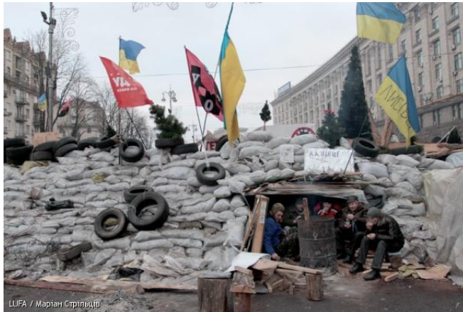
ШОРА / Мертан Стрелєв